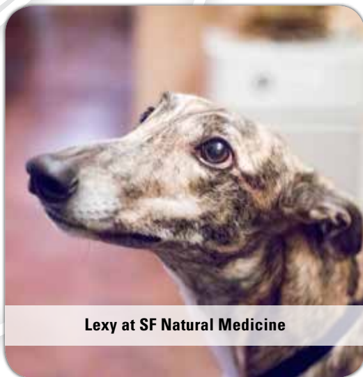
Lexy at SF Natural Medicine